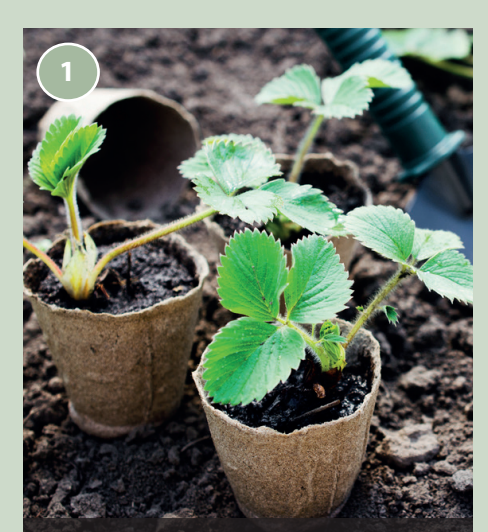
Space your plants evenly in the tub

The same strawberry plants will give you fruit for 3 or 4 summers!